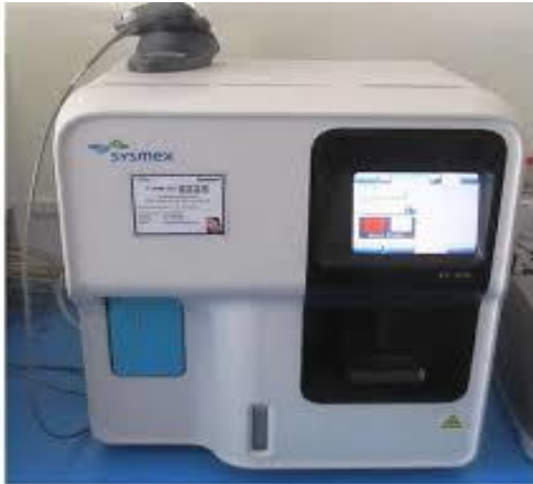
SYSMEX (CELL COUNTER)