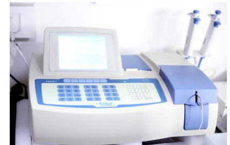
CHEM 7 (BIO CHEMISTRY)