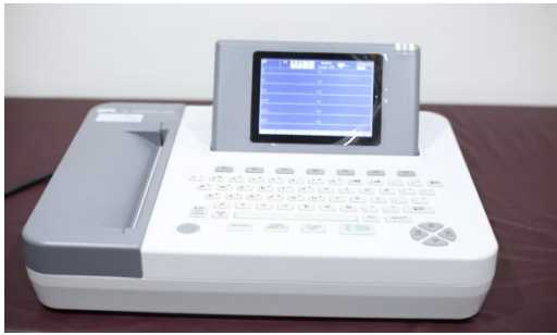
12 Channel ECG (Fully Automated)