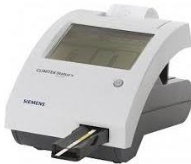
CLINITEK STATUS+ (URINE ANALYSER).