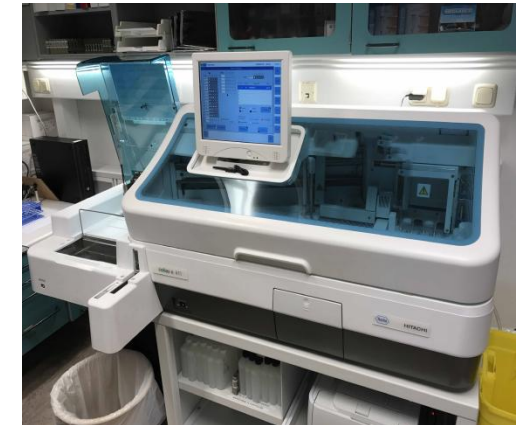
Roche Cobas E411 (IMMUNOLOGY)