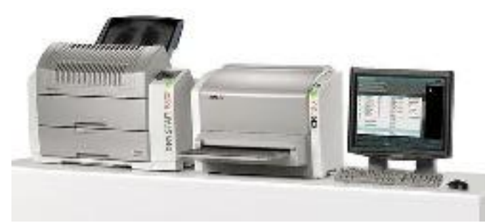
Agfa CR12-X (Digital Machine)