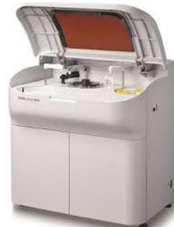
Dityi C S300B (BIOCHEMISTRY)