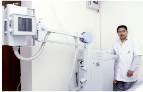
Allenger's high frequency (X-Ray)