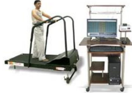
Tread Mill Test (TMT)