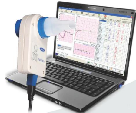
Pulmonary Function Test(PFT)